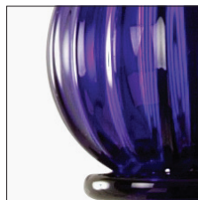
Blu Cobalto (BLC)