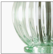
Verde Edera (VDE)