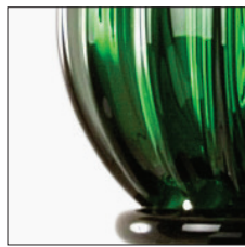
Verde Bottiglia (VDB)