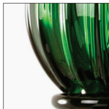
Verde Bottiglia (VDB)