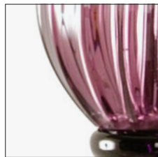
Ametista Scuro (ATS)