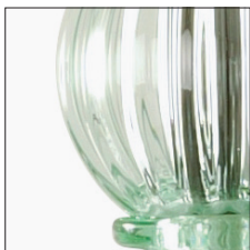
Verde Edera (VDE)