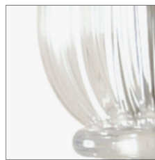
Cristallo Antico (CRA)