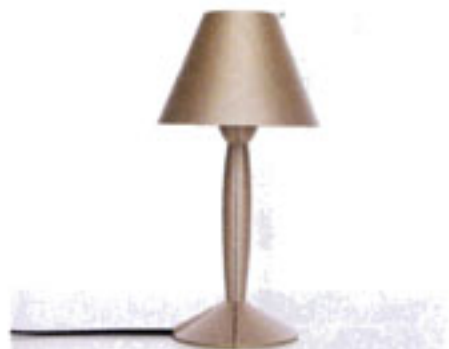
Biodegradable Miss Sissi

design developed by GIA Lighting, can be seen at the newly renovated Grosvenor House Apartments by Jumeirah Living in London's Park Lane. Contractor John Sisk & Sons approached trussing specialist Prolyte Group's special projects division Litestructures to create the structure for suspending above diners in the first-floor atrium which has a seven-storey-high ceiling. The pendant comprises a series of aluminium frames, linked together by braces at the upper frame, assembled in a concentric orientation. The frames are covered in a wide