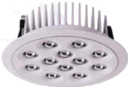
Concord LED LED 50

Developments in LED technology mean that interior lighting can be used to control and alter people's experience of a space to a level that was not possible with more traditional forms of lighting, says Ajay Vasdev, founding director of Asco Lights. "Advancements in RGB technology mean designs can now introduce colour change and mood lighting to create a multifunctional space for use at different times of the day and different purposes," he continues. With more colour and dimming options possible, LEDs can now achieve more aesthetically pleasing levels of warmth in "colour temperature" than before. "This, in the past, was not especially possible using LED lighting solutions, with the colour temperature erring on the side of being far too cold," Ajay adds. "Whilst cool lighting in certain situations may feel appropriate, a warm, inviting mood evoked by a lighting instalment is often preferable."