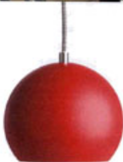
Ball from BoConcept