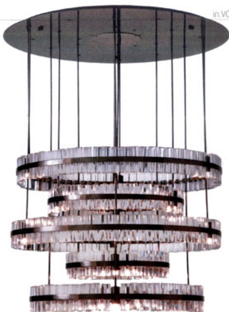
Crono Chandelier from Baroncelli

design developed by GIA Lighting, can be seen at the newly renovated Grosvenor House Apartments by Jumeirah Living in London's Park Lane. Contractor John Sisk & Sons approached trussing specialist Prolyte Group's special projects division Litestructures to create the structure for suspending above diners in the first-floor atrium which has a seven-storey-high ceiling. The pendant comprises a series of aluminium frames, linked together by braces at the upper frame, assembled in a concentric orientation. The frames are covered in a wide