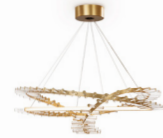
IMAGE SHOWS Satin gold with cristallo rods