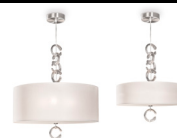
IMAGE SHOWS Acciaio scuro glass