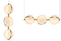
IMAGE SHOWS Satin gold with opaque glass sphere