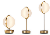
IMAGE SHOWS Satin gold with opaque glass sphere