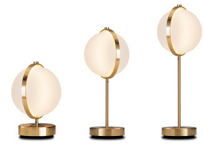
IMAGE SHOWS Satin gold with opaque glass sphere