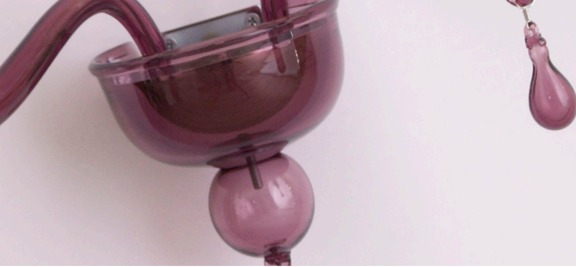
DELFO WALL LIGHT