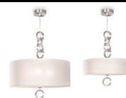
IMAGE SHOWS Acciaio scuro glass