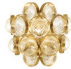
IMAGE SHOWS Cristallo glass spheres with spiral ribbing on a satin gold frame