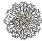
IMAGE SHOWS Cristallo snow flakes