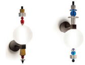
IMAGE SHOWS Opaque sphere, Coloured glass with matt black stem, finials and wall cover.