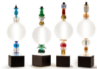
IMAGE SHOWS Opaque sphere, coloured glass with matt black stem, finials and table base.